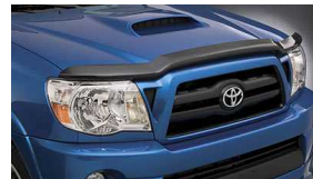
Hood Protector $119 Installed MSRP*