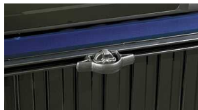
Cleat Tie Down $53 Installed MSRP*