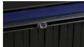
Mini Tie Down Loop $40 Installed MSRP*