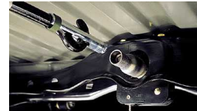
Spare Tire Lock $73 Installed MSRP*