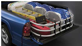
Bed Extender $282 Installed MSRP*