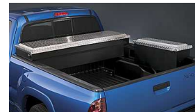
Storage Boxes - Large $599 Parts Only MSRP**