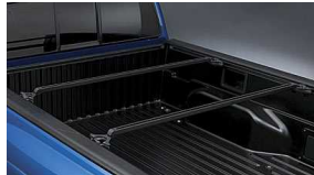
Cargo Cross Bars $124 Parts Only MSRP**