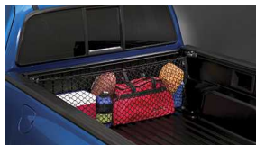
Cargo Net $49 Installed MSRP*