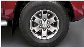
Baja 16" Alloy Wheel $695 Installed MSRP*