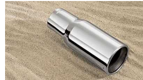
Exhaust Tip $85 Installed MSRP*