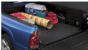
Bed Mat $119 Installed MSRP*