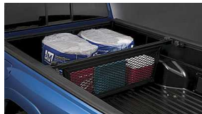
Cargo Divider $279 Parts Only MSRP**