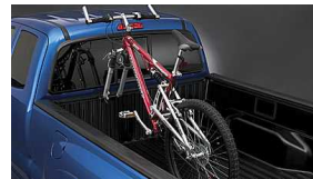
Fork Mount Bike Attachment $49 Parts Only MSRP**