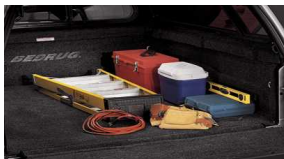
Bedrug $379 Parts Only MSRP**