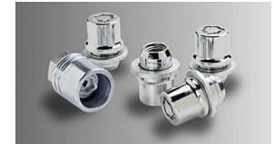
Wheel Locks $81 Installed MSRP*