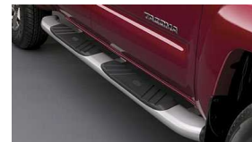
Tube Steps Reg Cab $399 Installed MSRP*